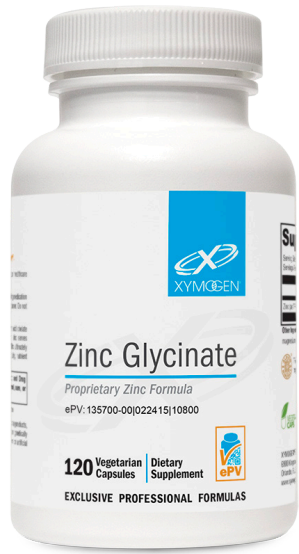
Available in 120 capsules